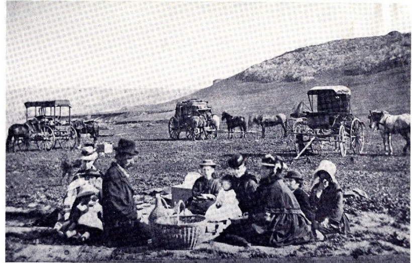
A PICNIC AT THE COVE in what is now Scripps Park, probably taken in the late 1870's. From a stereopticon view.