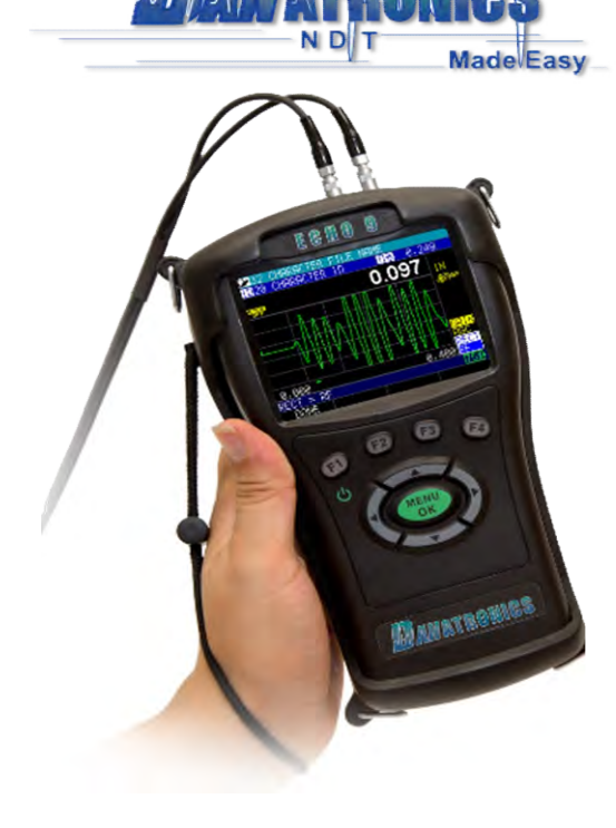
(Carbon Steel and Stainless Steel)