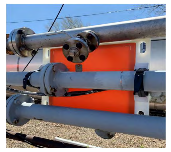
Mount kit with pipe cleats to reduce stress on the detector for pipeline imaging.

• WIRELESS - The HPX-DR detector can operate completely wireless giving the user full freedom of movement and minimizing set-up time on site. This is especially helpful for rope access teams looking for minimal weight, high sensitivity and a powerful wireless connection.