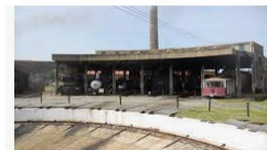
Georgia State Railroad Museum ... pinterest.com