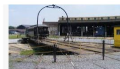
RAILROADING IN GEORGIA STARTED IN ... dickworld.wordpress.com