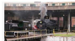
Roundhouse Railroad Museum Savannah ... trolleytours.com