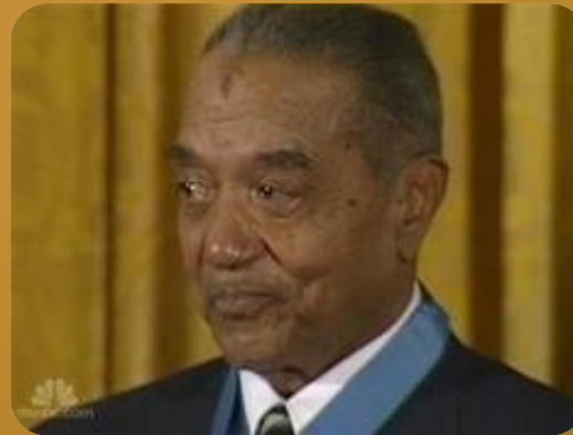
Lt. Vernon Baker Medal of Honor WWII, 1997