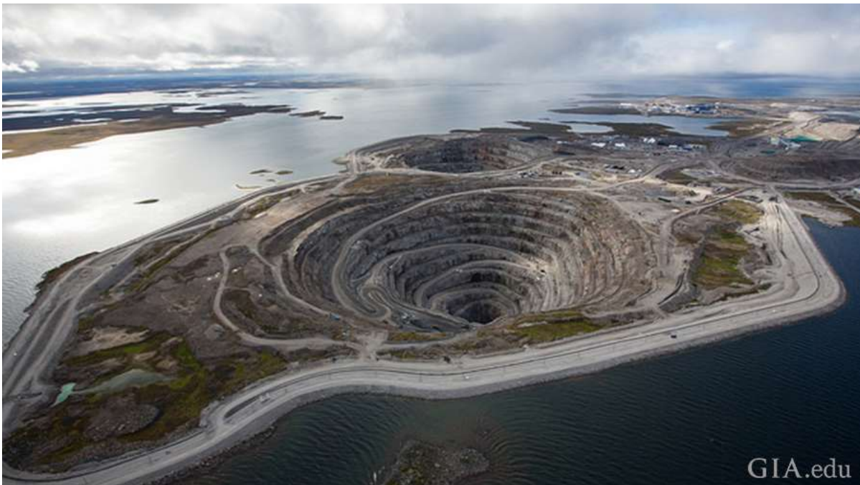
Canada Diavik diamond mine summer A154 dike and open pit. To safely open-pit mine its ore bodies, extinct volcanoes located just offshore under the lake waters, dikes were built.

Diamonds in Botswana lie in the typically hot, semi-arid eastern region of the country. These prolific mines have brought a boom to the economy, creating a growing middle class. The country is also a diamond hub, where approximately 40 percent of the world's supply of rough diamonds are sorted and valued.