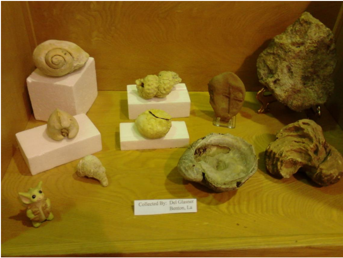
Del Glasner- Last year's Fossil display