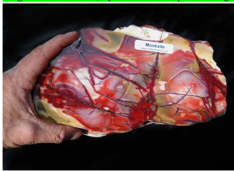
Program - Mookaite (if you have some, please bring for show & tell)

Directions: Hwy 71( Barksdale Blvd) 2.1 miles south of Barksdale West gate, turn left at (Mcdonalds) onto Shady Grove dr. and go down 7 streets to Wayne Ave. and turn left and follow to Library