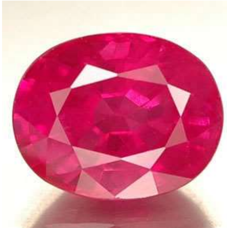
Ruby - Birthstone of the month