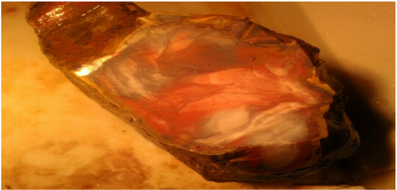
Polished Mozarkite found in Lincoln County Missouri