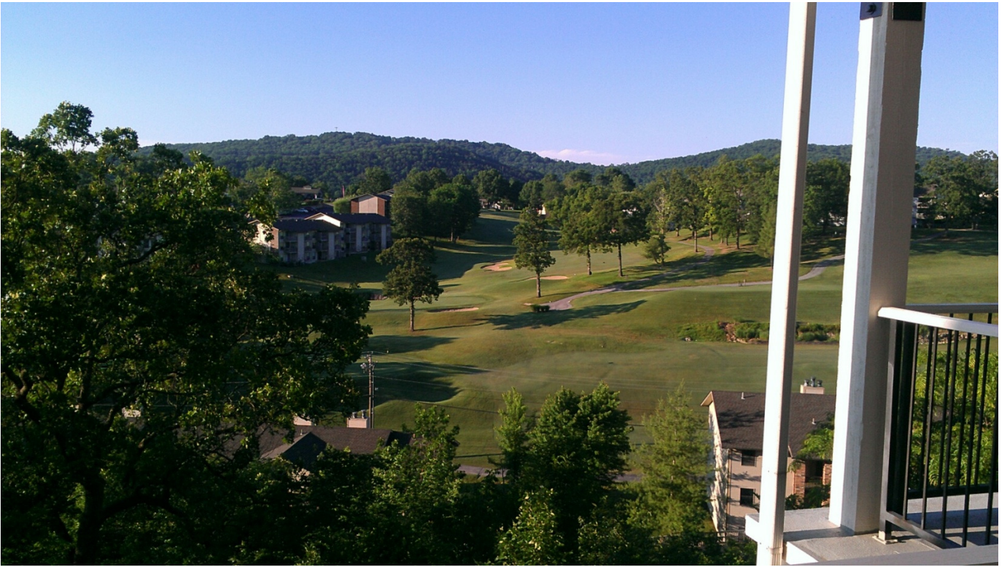
View from our room