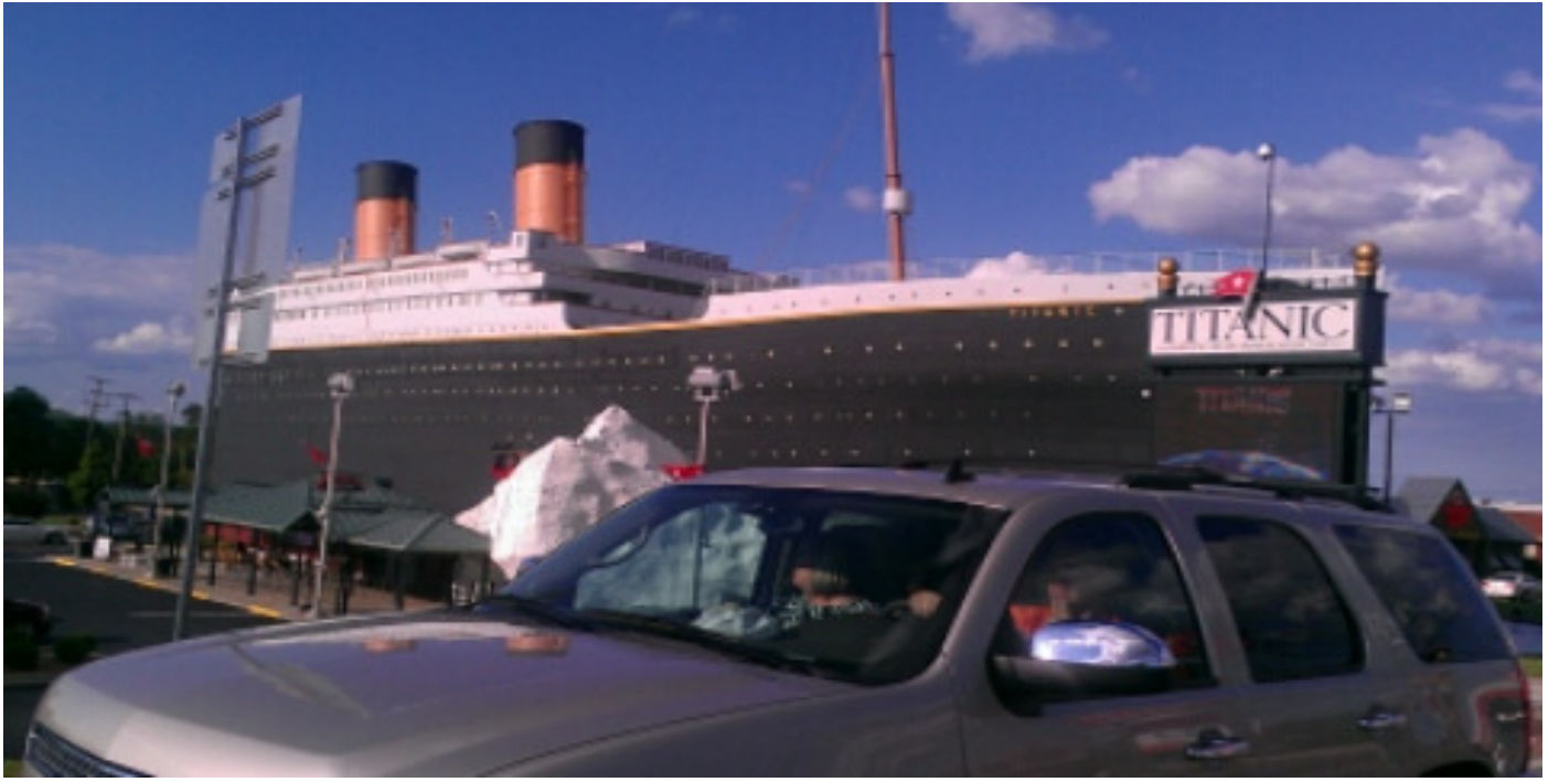
Sightseeing in Branson