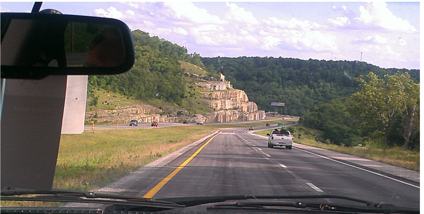
The view while driving to Lincoln County Missouri