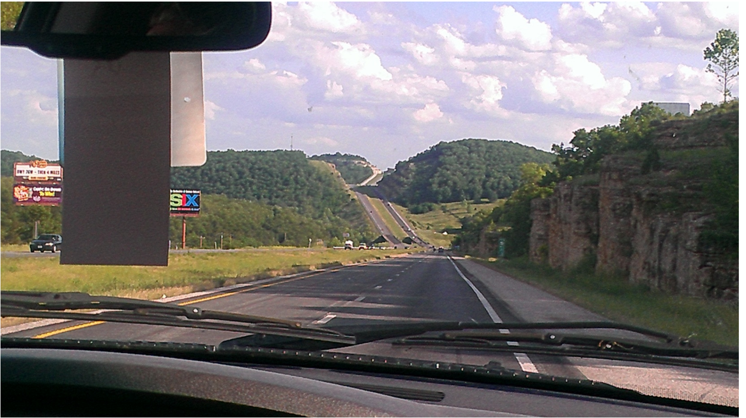
The view while driving to Lincoln County Missouri