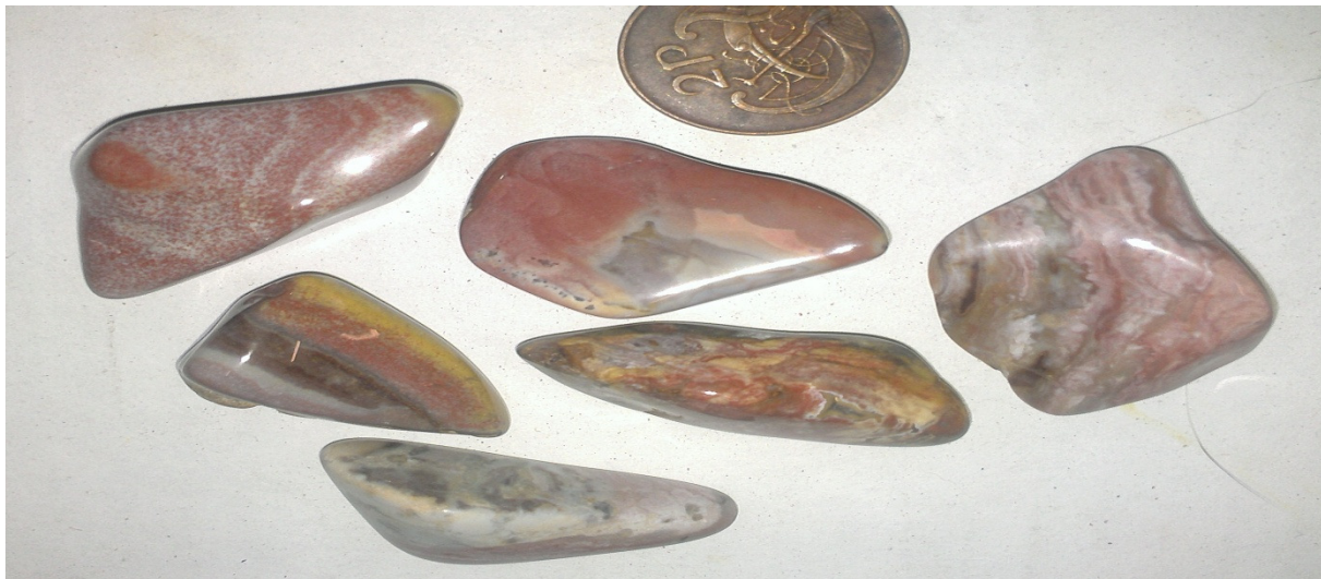
Polished Mozarkite found in Lincoln County Missouri