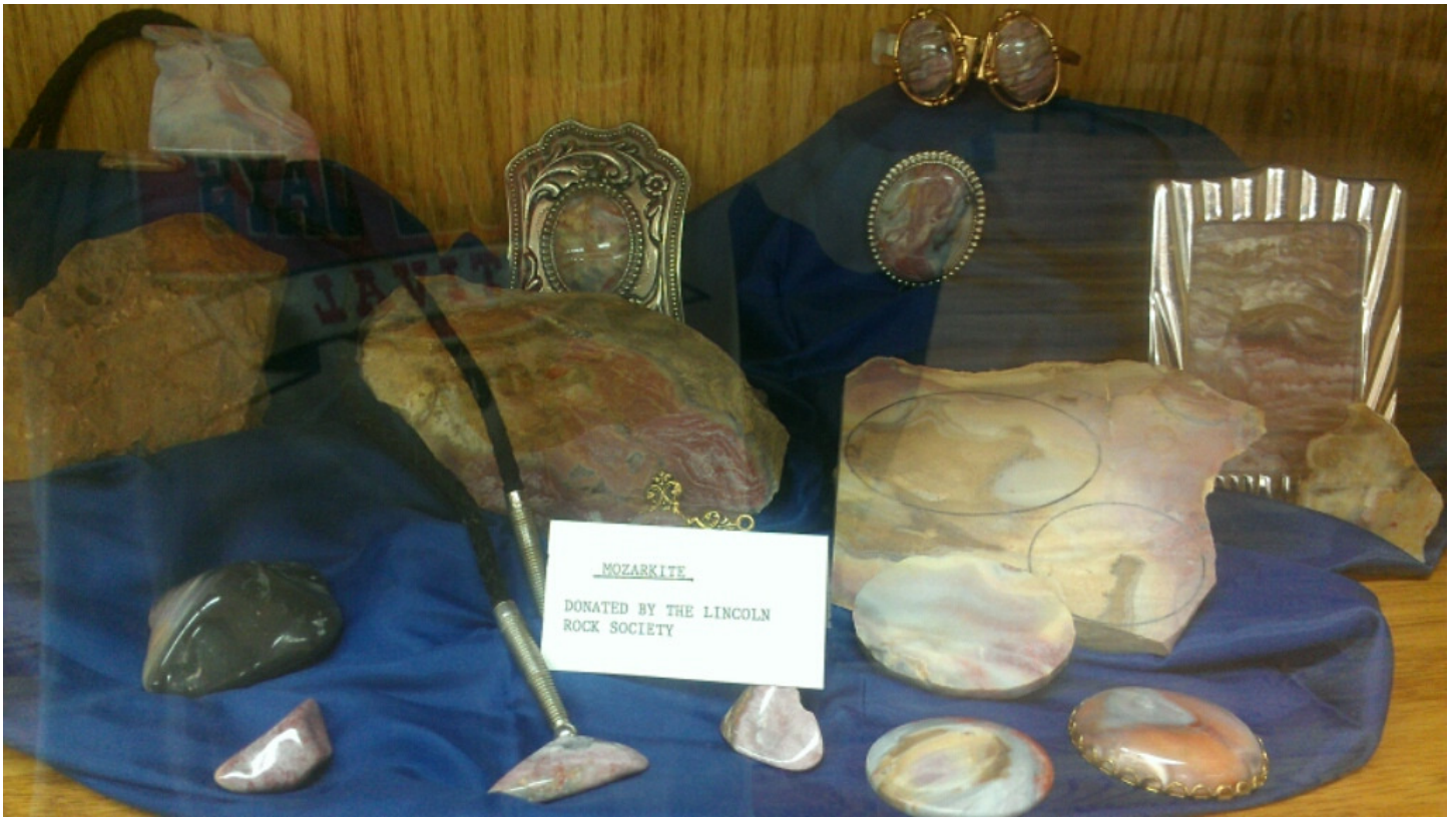
Display of Mozarkite