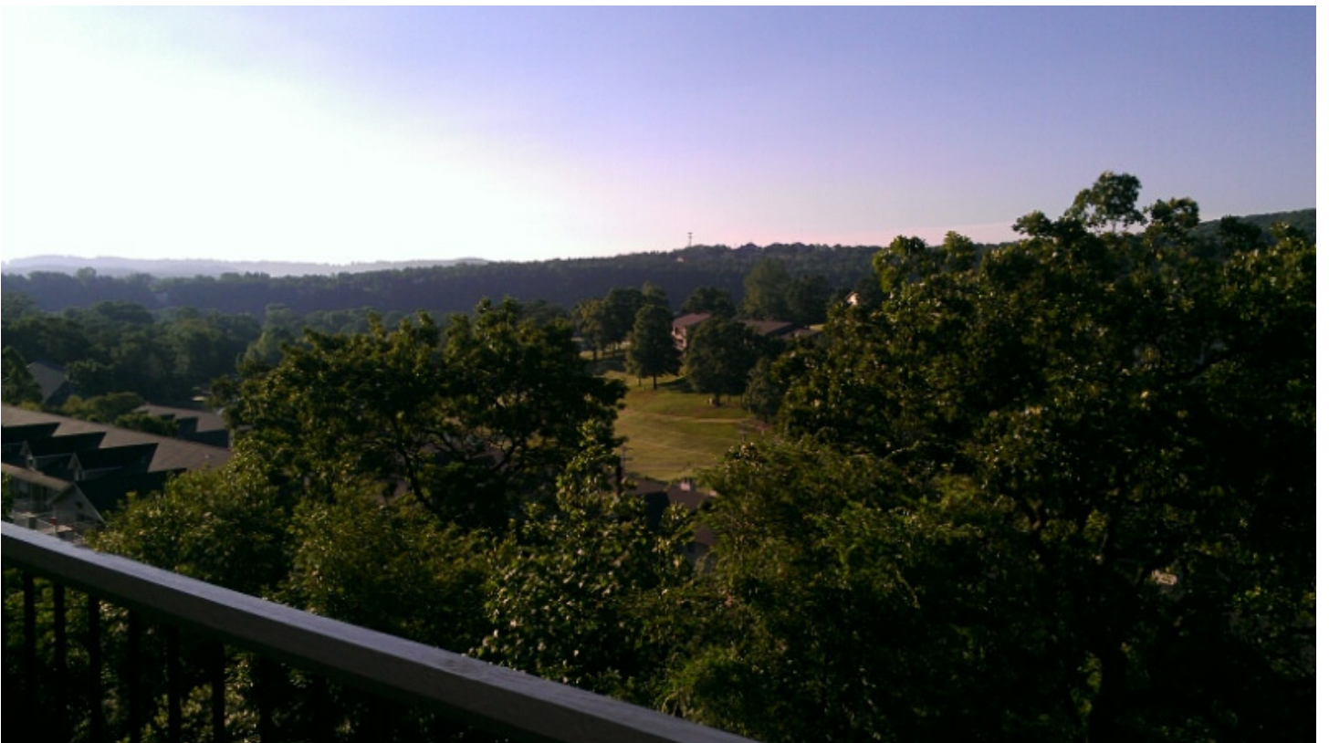
Another view from our room