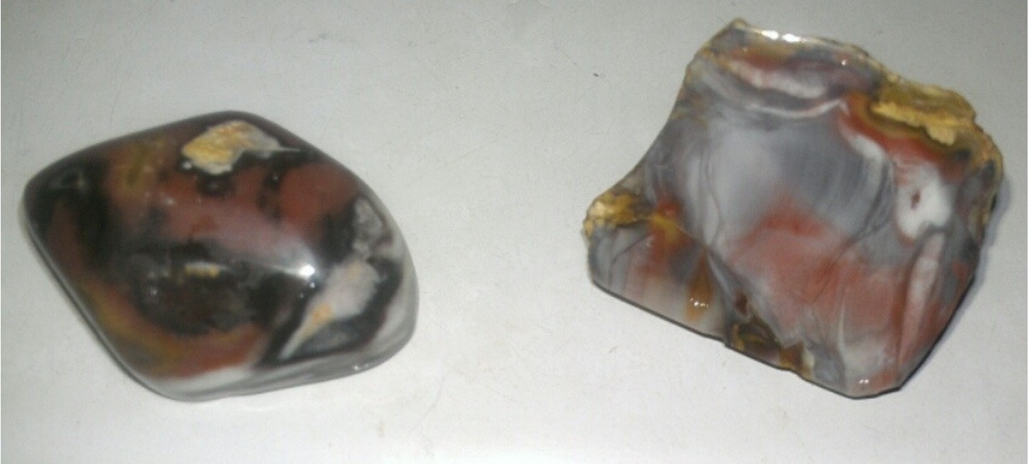
Polished Mozarkite found in Lincoln County Missouri