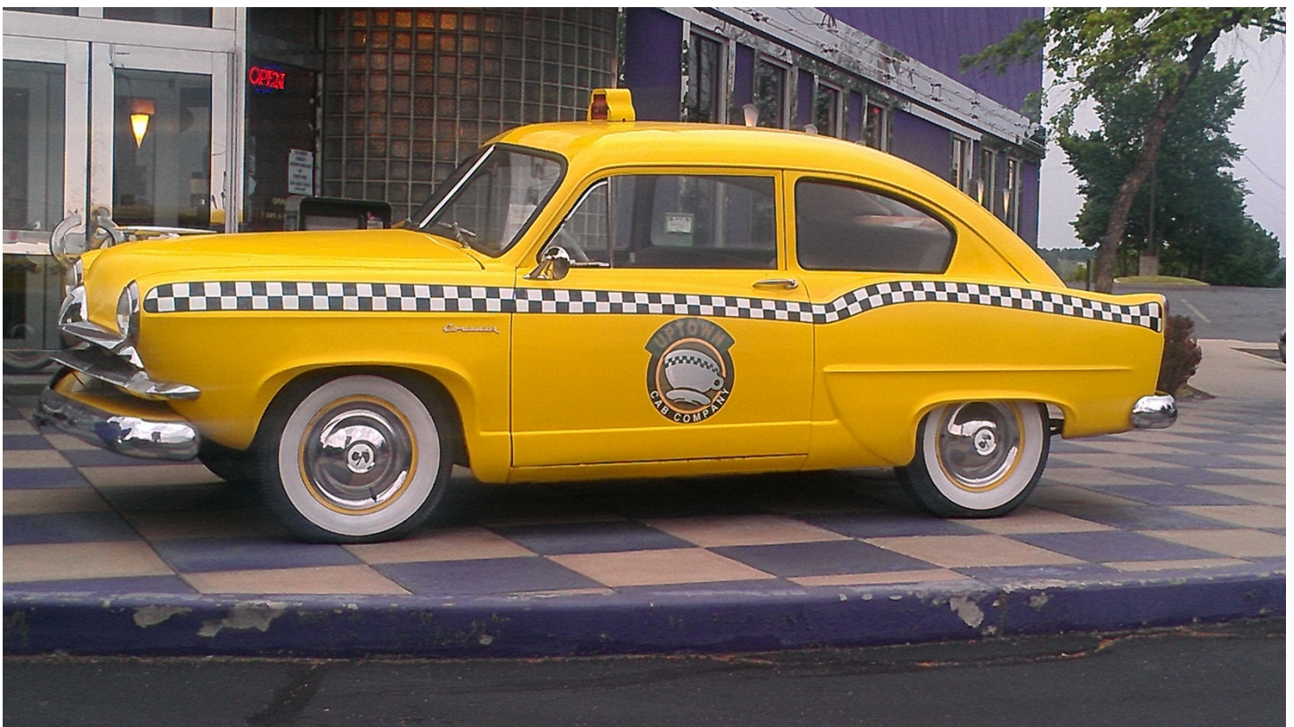
Siteseeing in Branson