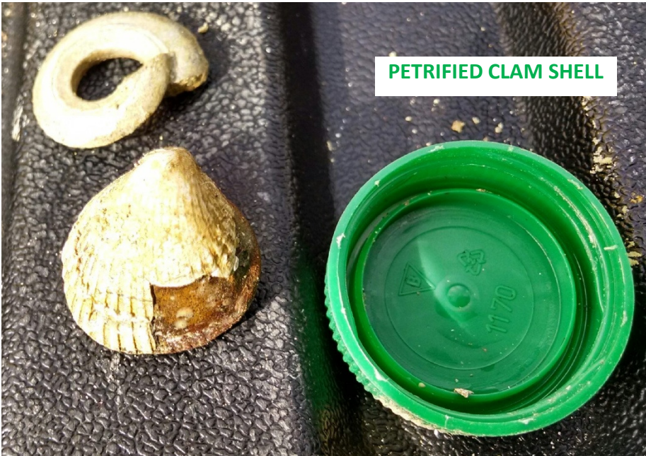
PETRIFIED CLAM SHELL