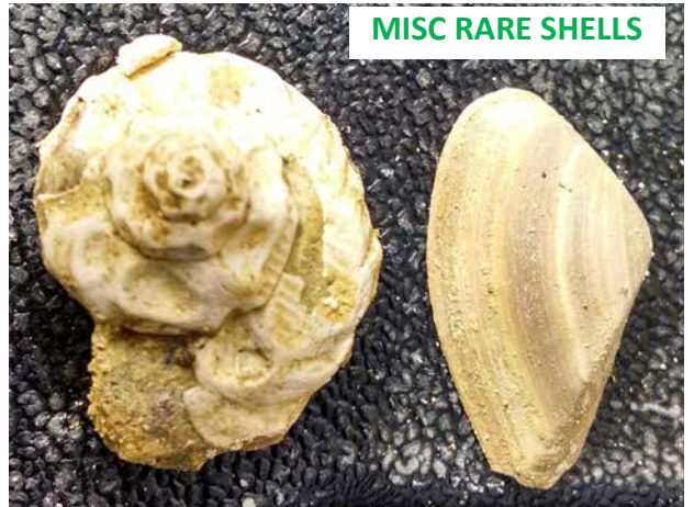
MISC RARE SHELLS