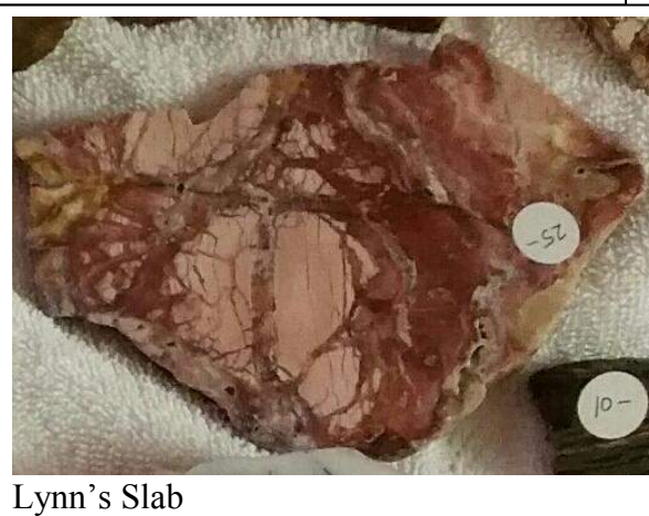
Larry's Palm Slabs

Websites to look at: <u>http://www.rocksandminerals4u.com/</u> <u>http://www.arrowheads.com/index.php/artifact-events/view-</u> events/icalrepeat.detail/2017/04/08/351/-/nacogdoches-tx-artifact-show