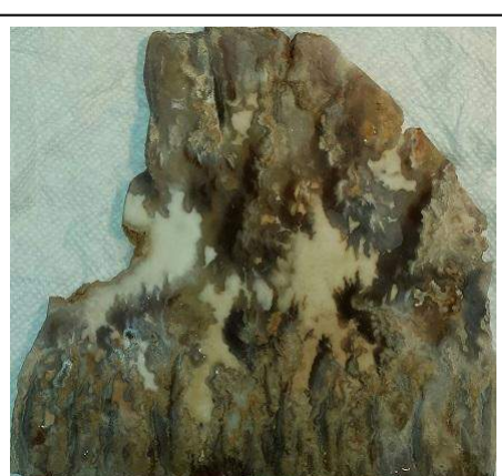
Lynn's Graveyard Point Plume Agate