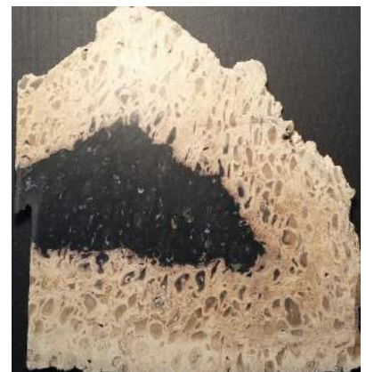
Lynn's Indonesian Palm Root