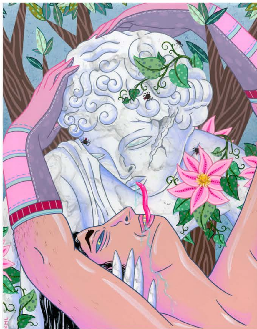
Kristen Liu Wong His Lips Were Quite Cold, 2020

Acrylic, acrylic gouache on cradled wood panel