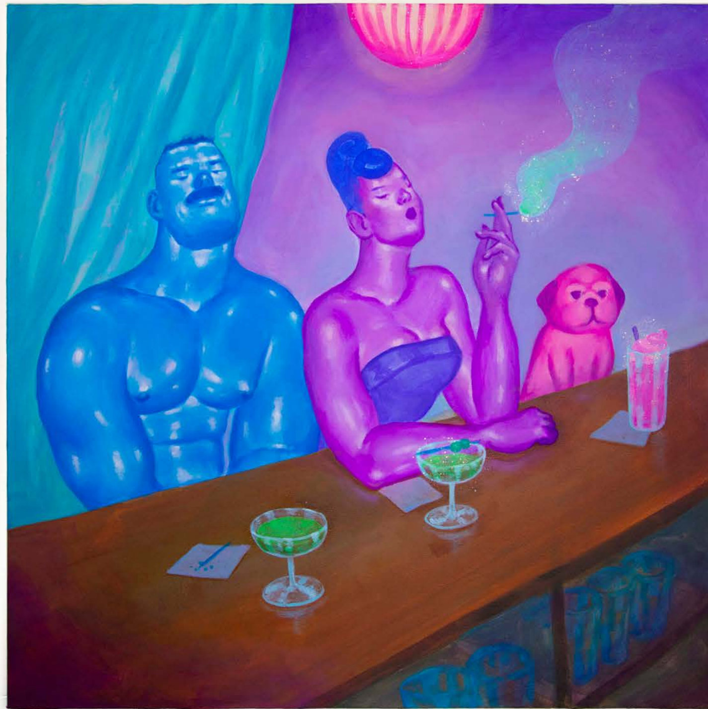
Justin Yoon Goodbye to Spring, 2023 Acrylic, acrylic gouache, glitter on canvas 40"x40" $7,000