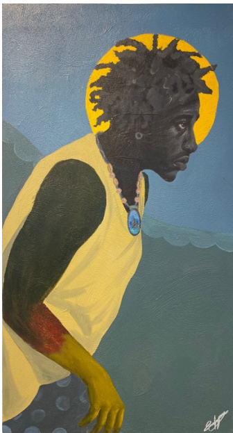
Di Bless Da Coin Chain: II Eddion Whymms Acrylic on Wood Panel 26.5 x 48