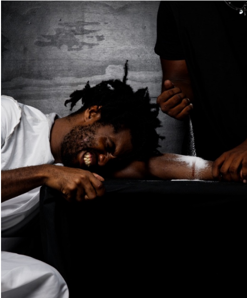
Bildad's Honor Chappell Whyms Digital Photography on Ilford Galerie 20x24"