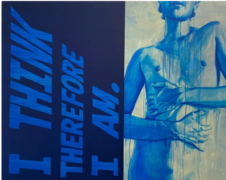
I Think Therefore I Am, 2024 Jordon Ritchie 48" x 60" Acrylic and Graphite on Canvas