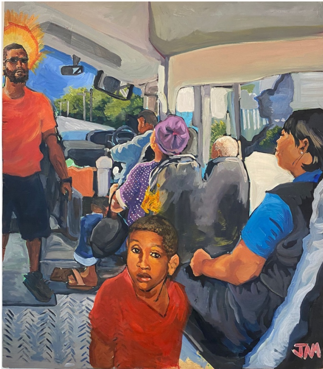
5) Da Old People Bus Justin Moultrie 41.25 x 48" Acrylic on Wood Panel