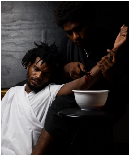
Eliphaz's Justice Chappell Whyms Digital Photography on Ilford Galerie 20x24"