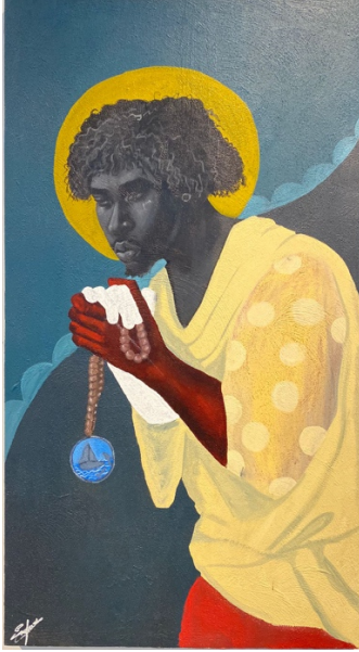
Di Bless Da Coin Chain: I Eddion Whymms Acrylic on Wood Panel 26.5 x 48