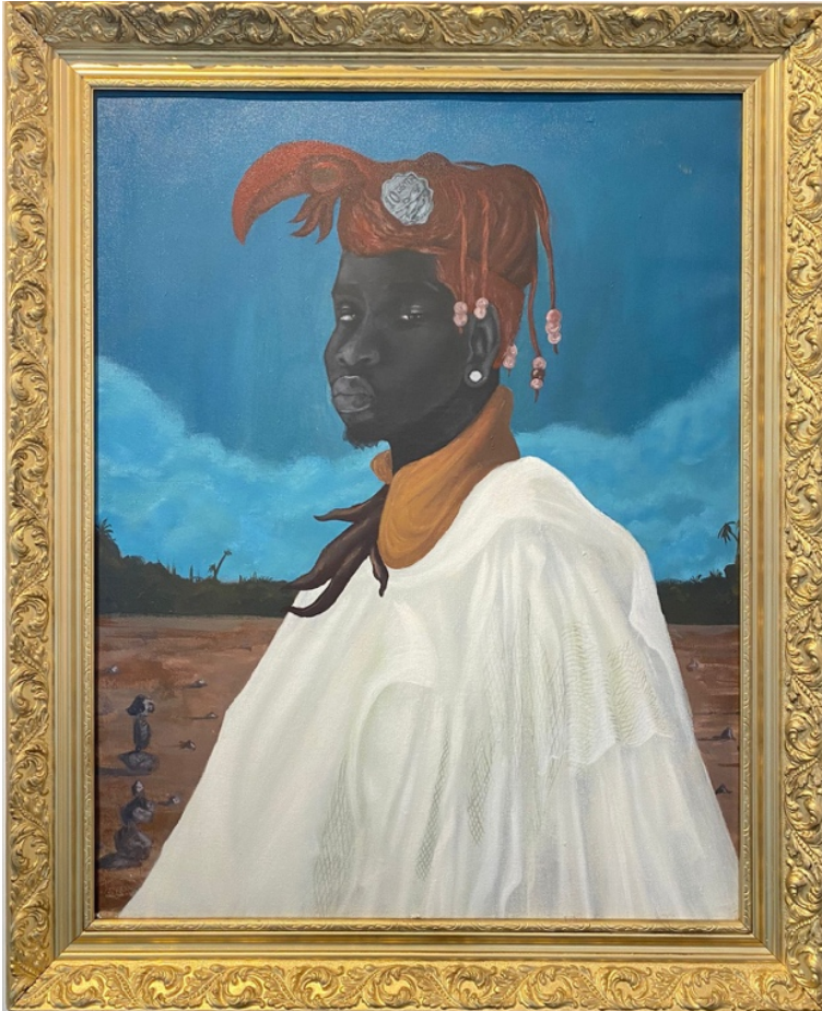
Sentinel Of A Forgotten Land Eddion Whyms 26.5x34" Acrylic on Canvas