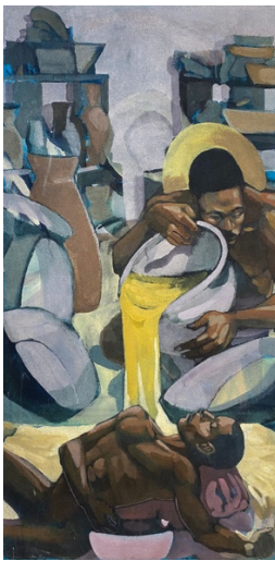
Pour Into Me Navarro Newton Acrylic on Canvas 20x40"