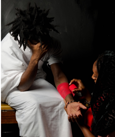
Elihu's Service Chappell Whyms Digital Photography on Ilford Galerie 20x24"