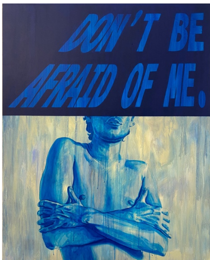
Don't Be Afraid Of Me, 2024 Jordon Ritchie 60" x 48" Acrylic and Graphite on Canvas