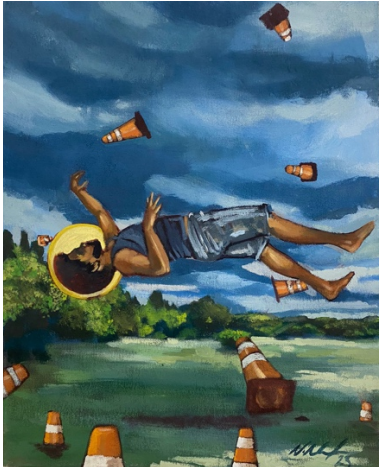
The Navigator Navarro Newton Acrylic on Canvas 16x20"