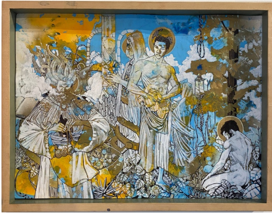
Rorschach Navarro Newton Mixed Media on Paper 19.5 x 25.5"