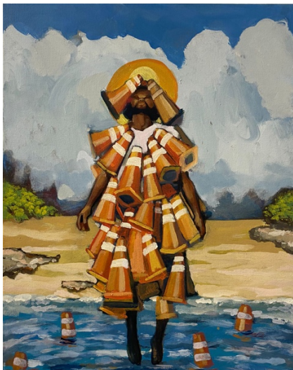
Red Flag Navarro Newton Acrylic on Canvas 16x20"