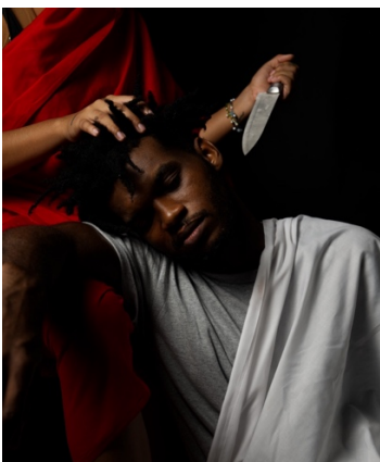
Sitis' Mercy Chappell Whyms Digital Photography on Ilford Galerie 20x24"