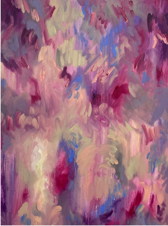
Queen Of The Conchs, 2024 Jordon Ritchie & Terran Brice 40" x 30" Acrylic on Canvas