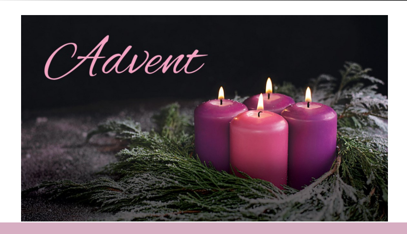
Advent- a season of hope and expectation