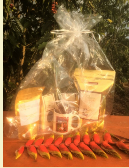
Taste of Hawaii Package