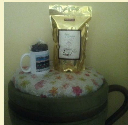
Cup Full of Beans Package