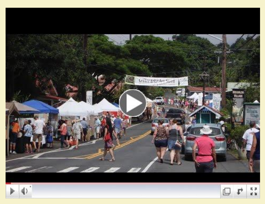
Kona Coffee and Cultural Festival

recently been renamed the Kona Coffee and Cultural Festival. Not only does the festival celebrate all things coffee, the Festival now extends to showcasing the cultural contributions of the Big Island's diverse population.