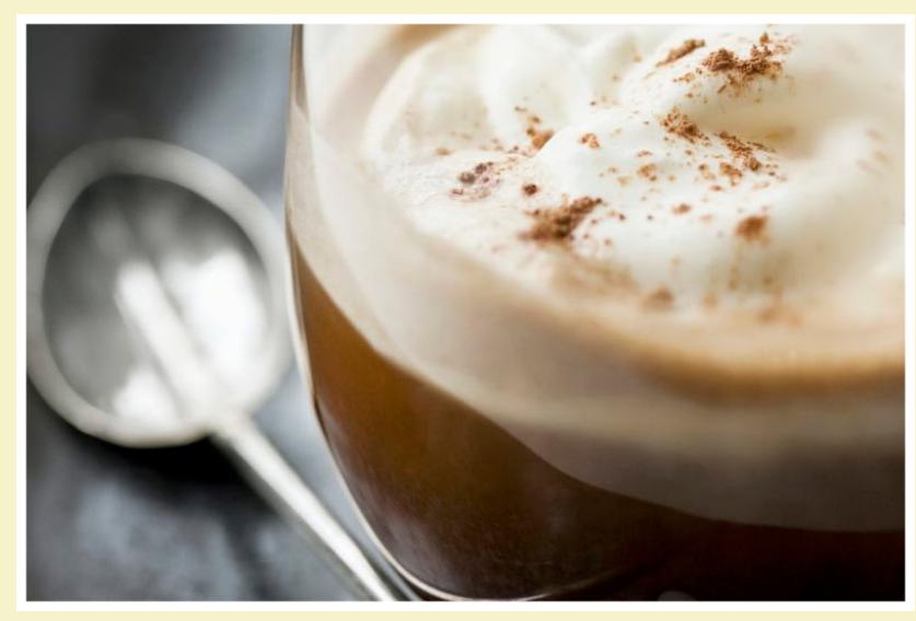
The Café Brasileiro is a very sweet, complex drink from the mind of John Gakuru.

It is sweet, a mix of cachaca, chocolate liqueur, and a special vanilla cream - all of that with fresh hot coffee.