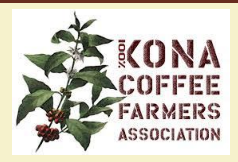
KCFA Fighting the Good Fight!

Spring is warm and beautiful here in Kona but the Kona Coffee Farmers Association (KCFA) is up in arms and red hot under the collar. Those of us who believe in only 100% Kona coffee have dealt with the "shenanigans" of unscrupulous blenders for years. Unaware, many people come to Hawaii, buy Kona coffee not realizing that the deceptive packaging often times only contains 10% Kona with the 90% made up of inferior beans from other countries. Check out our beans and notice the difference (KonAroma vs others).