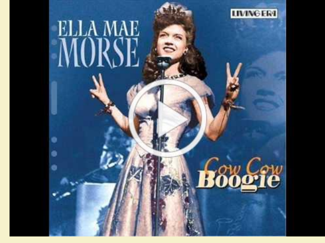
Ella Mae Morse - Forty Cups Of Coffee

We love to hear from our customers! Kindly, send us comments, pictures or even videos of you enjoying your KonAroma coffee products.