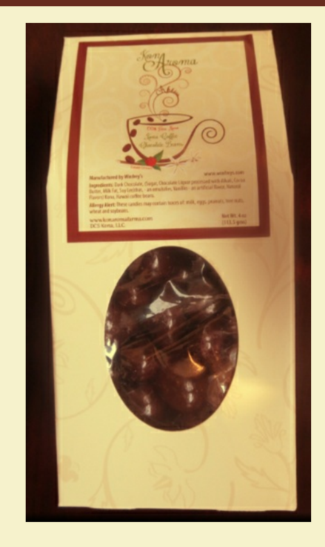
Chocolate Covered KonAroma Beans ORDER