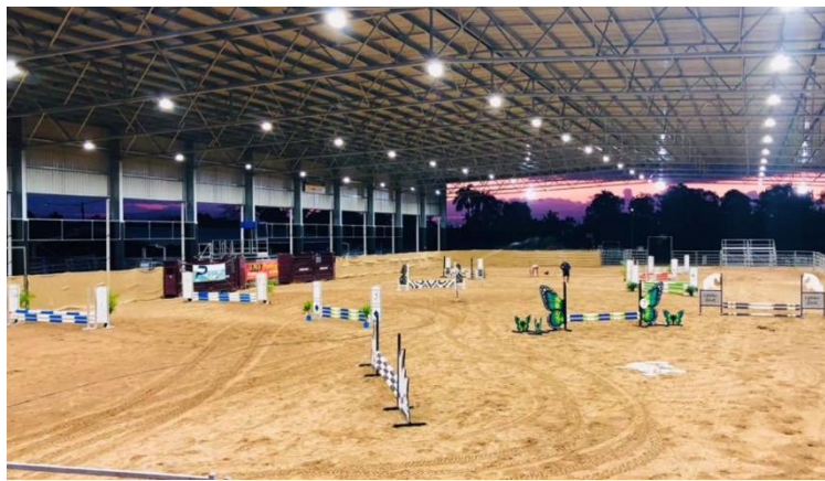
2019 Tropical North Showjumping Championships