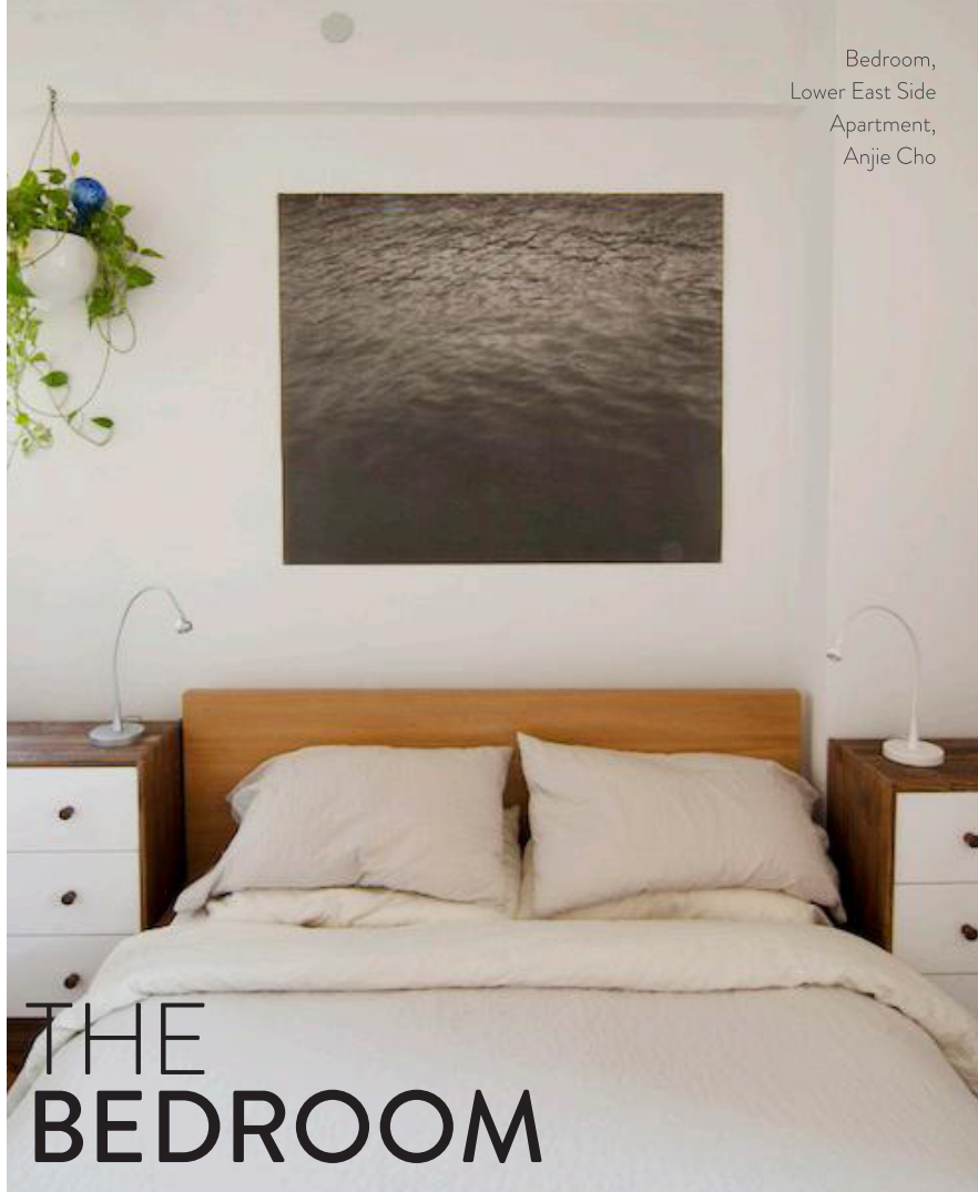
Bedroom, Lower East Side Apartment, Anjie Cho