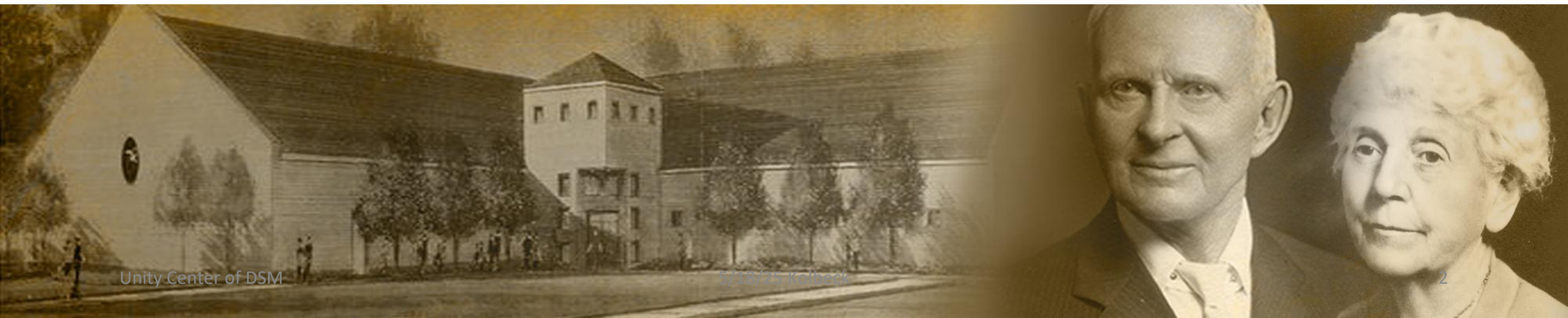
Unity Center of DSM

Unity is a global, inclusive, spiritual community. We offer practical, uplifting resources to help people of all faiths apply positive spiritual principles to their lives.