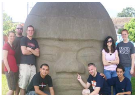
Chi Alpha poses in front of the largest Colossal Basalt Warrior heads to be found in this region.

to see them next year here in tropical San Andres Tuxtla, Veracruz.