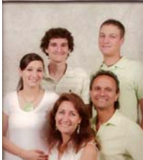
THE WARREN WARRIORS

Email: the_warren_warriors@yahoo.com Web: www://casa.de.gloria.ministries.20megsfree.