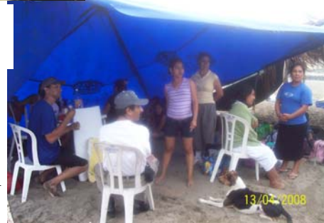
Seeking shelter from the 40 mph winds!

the rain & 40 mph winds on the beach under a plastic lean to between eating, playing volleyball and tag.