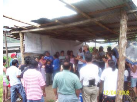
Service under cover.

the rain & 40 mph winds on the beach under a plastic lean to between eating, playing volleyball and tag.