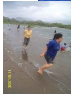
Playing water tag, making the most of a very cold situation.

wet situation. Everyone had a wonderful time from beginning under a small tin roof covering by the cars to seeking shelter from