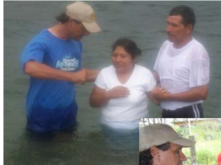
This couple rededicating their hearts to God.

Unusual rain and cold temperatures didn't deter this church from going to the beach for a baptism & child dedication. The weather changed the day we went to the beach from being in the low 100's to dropping to around 65 degrees