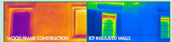
Wood frame walls (left) are warm and lose heat, ICF walls (right) remain neutral losing little to no heat.