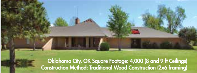
Oklahoma City, OK Square Footage: 4,000 (8 and 9 ft Ceilings) Construction Method: Traditional Wood Construction (2x6 framing)

Yearly Energy Costs: $3,656.25 ($0.91 sq.ft./year)