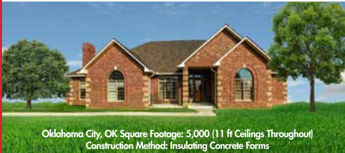
Oklahoma City, OK Square Footage: 5,000 (11 ft Ceilings Throughout) Construction Method: Insulating Concrete Forms

Yearly Energy Costs: $1,886.63 ($0.38 sq.ft./year)