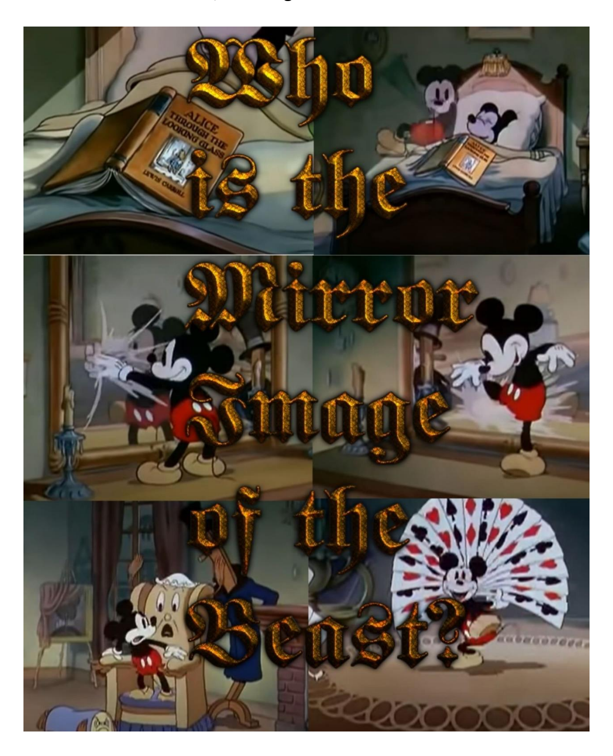
And so, we will get what we deserve.