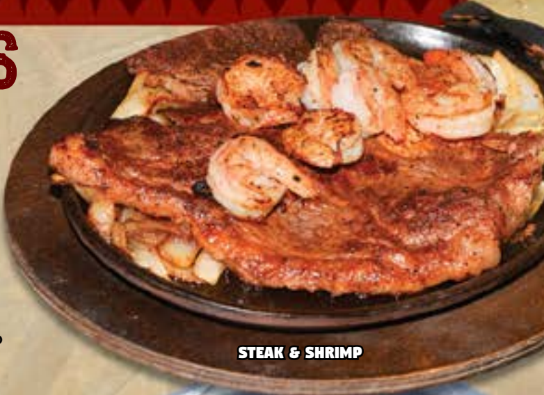
STEAK & SHRIMP

CARNE ASADA - Sliced ribeye steak from the grill topped with onions and fried jalapeño pepper served with rice, beans and tortillas 18.99