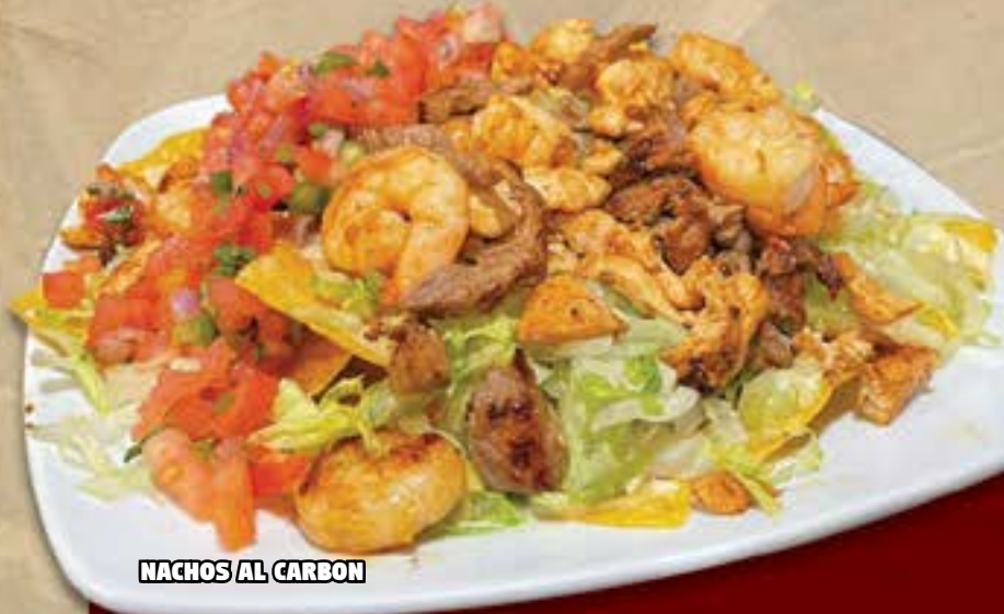
NACHOS AL CARBON

BEEF & BEAN NACHOS - Homemade chips smothered with melted cheese, topped with ground beef and beans. 11.49