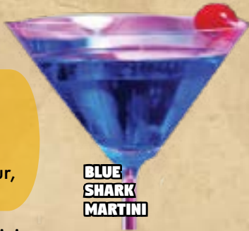
BLUE SHARK MARTINI

CANTARITO - Served in a traditional clay pot. Tequila, lime, orange juice, grapefruit juice, splash of grapefruit soda. Served with salt and tajin on the rim. 14.99