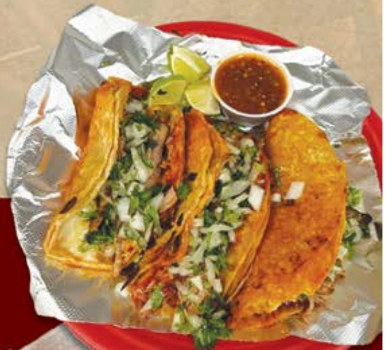
TACOS DE BIRRIA

A chalupa, taco, chile relleno, burrito, enchilada, rice and beans. 17.99