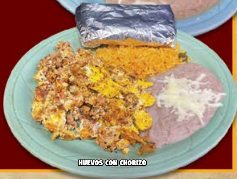
HUEVOS CON CHORIZO