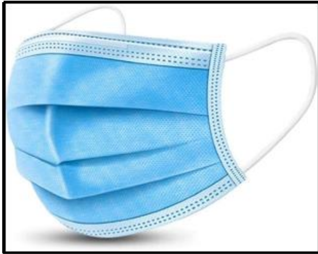
Model # MPG-0650