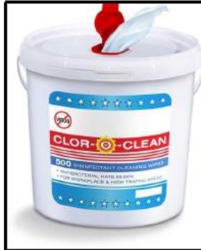
Bucket of 500