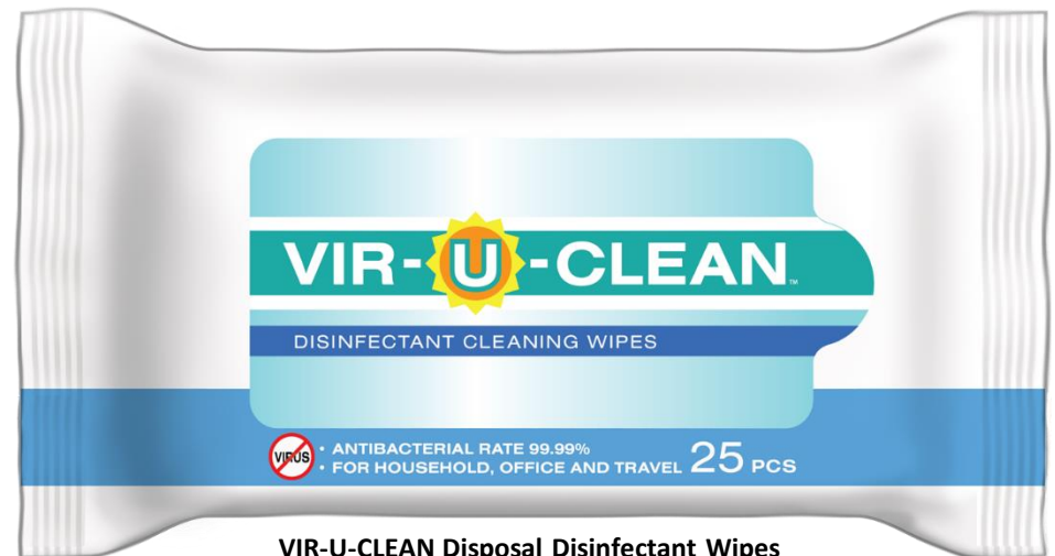
VIR-U-CLEAN Disposal Disinfectant Wipes

Active Agent – Chlorine Each pack consists of 25 wipes Each PDQ consists of 10 packs EPA Approved