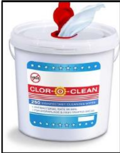
Drum of 250