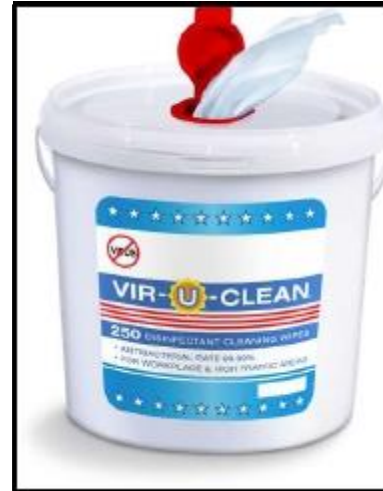
Drum of 250