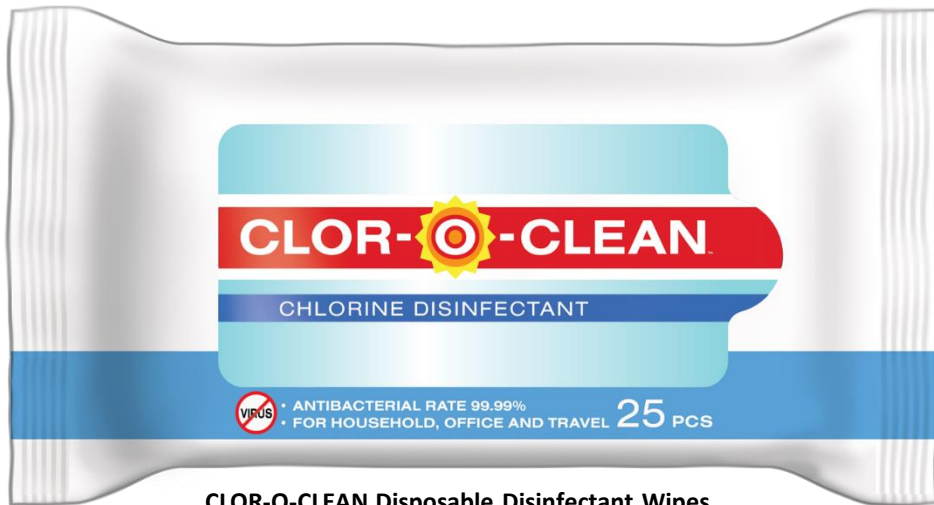
CLOR-O-CLEAN Disposable Disinfectant Wipes

Active Agent – Chlorine Each pack consists of 25 wipes Each PDQ consists of 10 packs EPA Approved