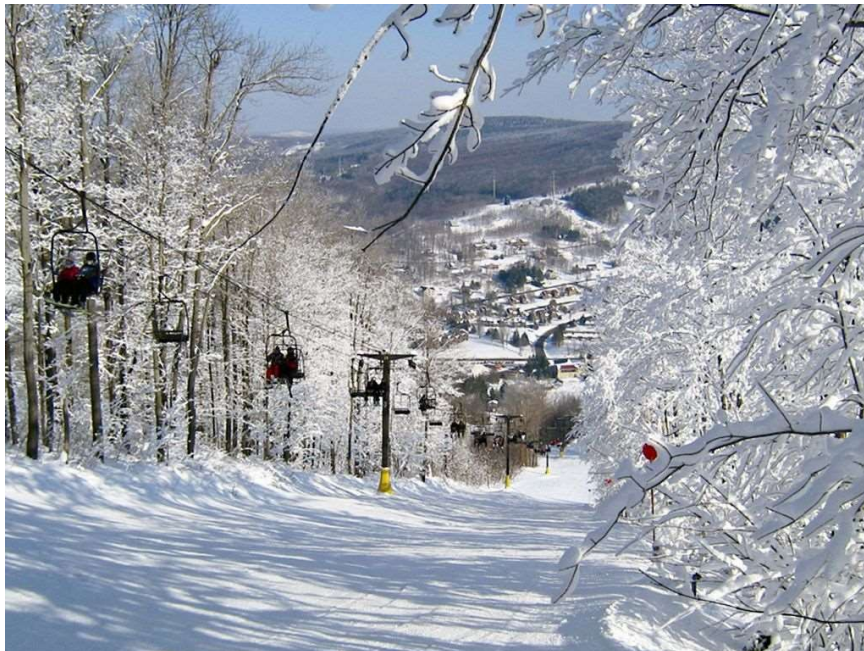
Coming right up...