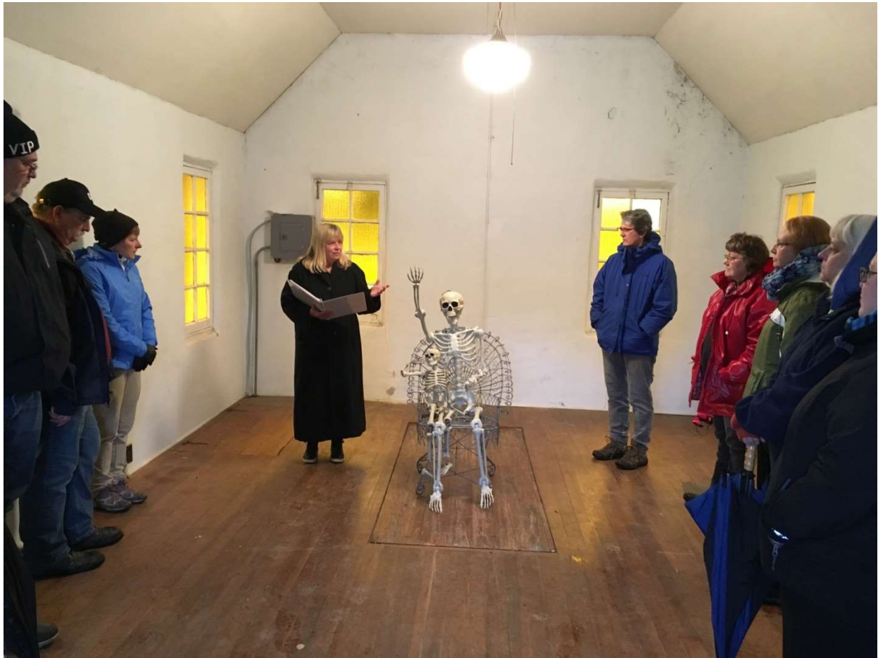
In the brick crypt

We had a spooky good time on October 27 at the Virgil Cemetery Tour.