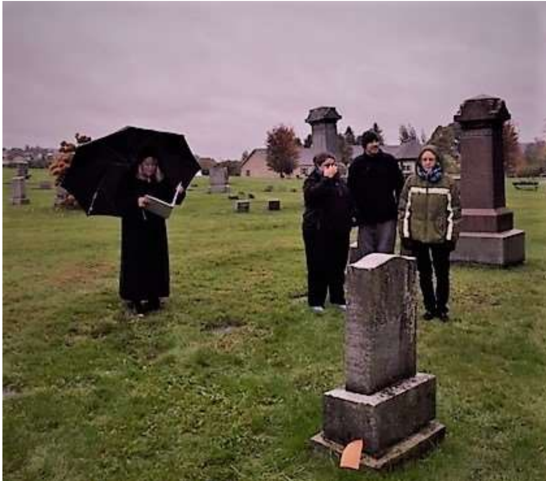
Storytelling in the graveyard