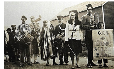
Band from Virgil, NY, year unknown. Does anyone know anything about this weird photo? Recognize the barn?

The Marathon Maple festival is April 18 and 19 this year. Don't miss it!