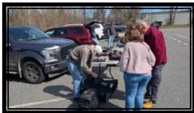
HOG YARD SALE & HOG Chapter Members built a fire pit at Wilkins Harley!!!!