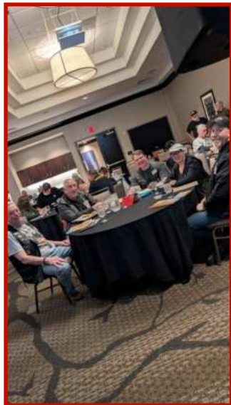
ROC in Schenectady, NY HOG Regional Officer Connection