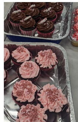
Fabulous confections from Kim Hidenfelter!