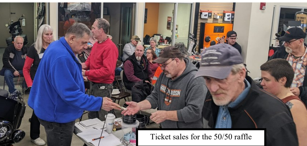
Ticket sales for the 50/50 raffle