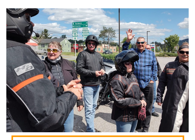
We went our separate ways homeward at Morrisville.