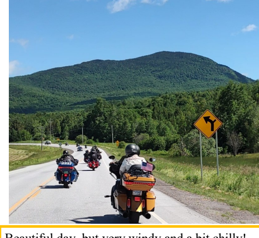
Beautiful day, but very windy and a bit chilly!