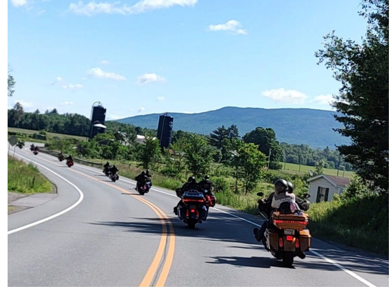
15 bikes/18 riders for the ride with 2 additional members at the restaurant for lunch