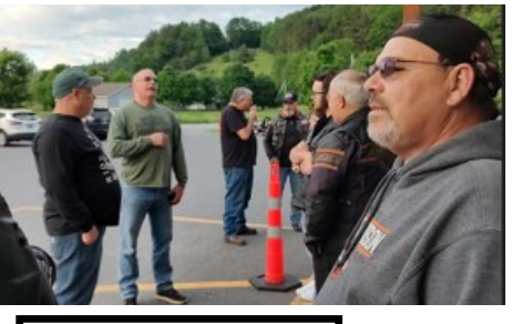
Time to enjoy ice cream or a creemeeand socialize!

Placing orders and waiting for them at the windows.