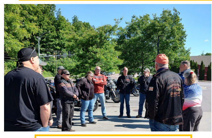
Getting ready to head out from Waterbury...