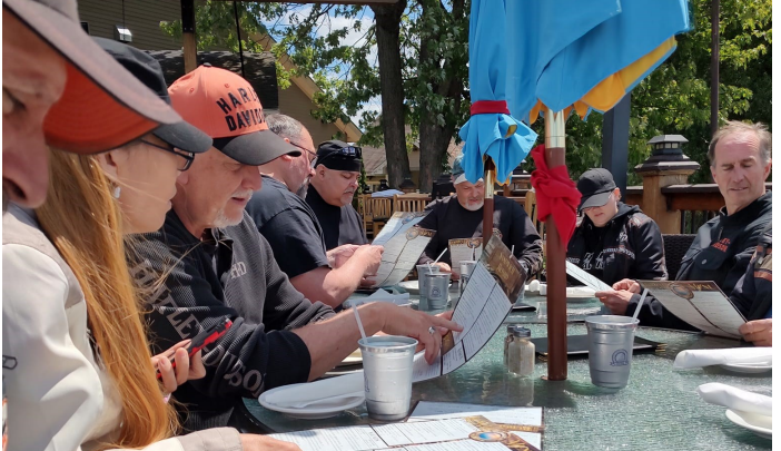
We were out on the deck at East Side Restaurant overlooking Lake Memphremagog. It looks sunny and warm in these photos but there was a brisk wind and when the sun was behind clouds, it was cold!!