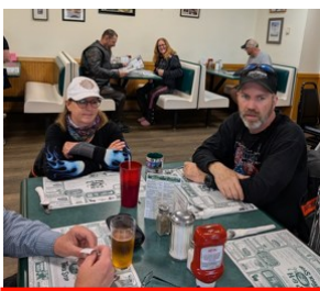
Breakfast at P&H to start the trip