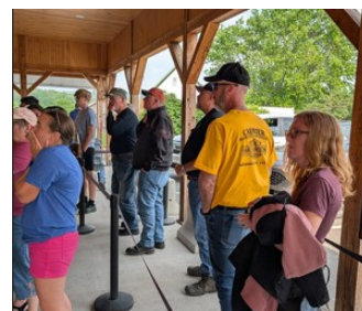
We ended the ride with ice cream at Hatchlands in Haverhill, NH