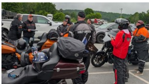
Starting out in rain suits...