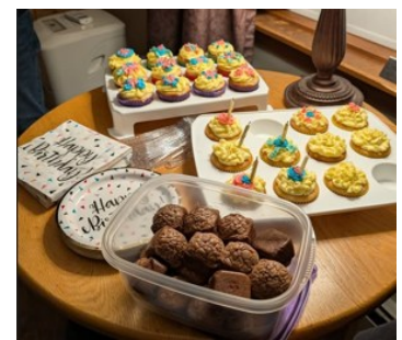
Birthday celebration for Linda's 70th