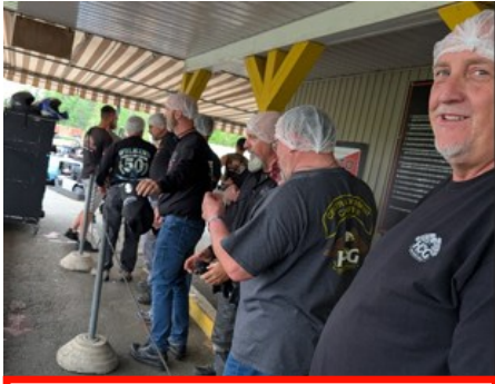
Getting ready for helmets...