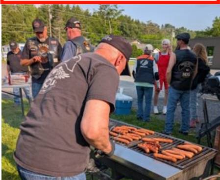
Grill master at work!