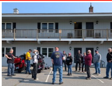
Preparing for Day 2— no rain suits this time!