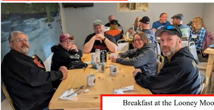
Breakfast at the Looney Moose cafe