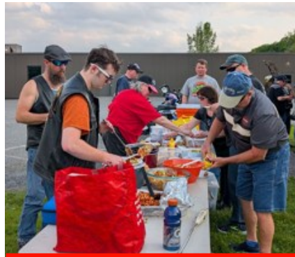
Time to 'dig in'...