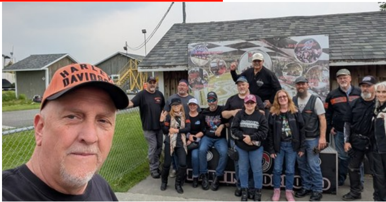
Karting in Magog, Canada before riding to The Spillover Motel in Stratton Maine for an overnight.