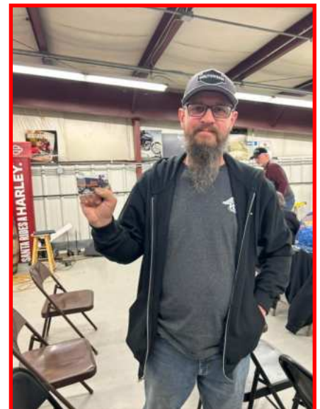
May 12 CHAPTER SOCIAL