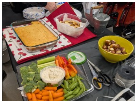
Food provided by members