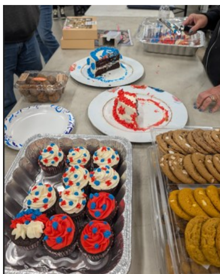
Plenty of desserts too