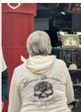
Door prize winners: