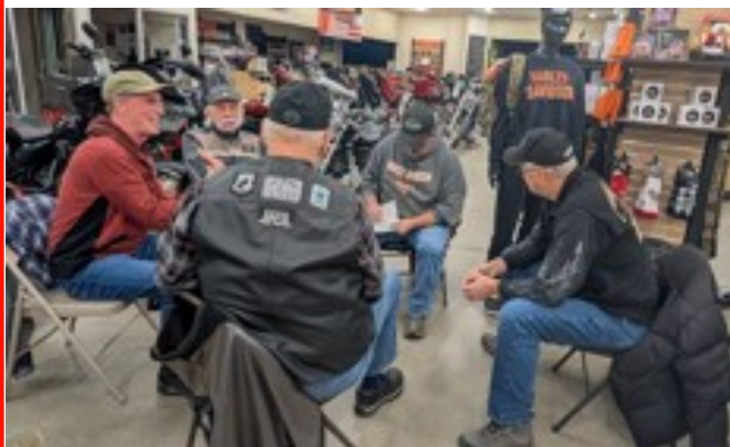
Small groups met to discuss preferred rides from 2025 and to suggest potential rides for 2026