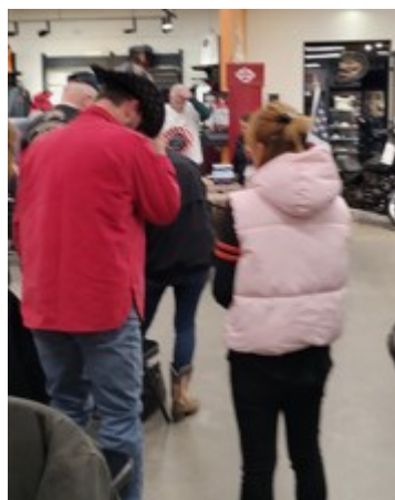
Pledge of allegiance