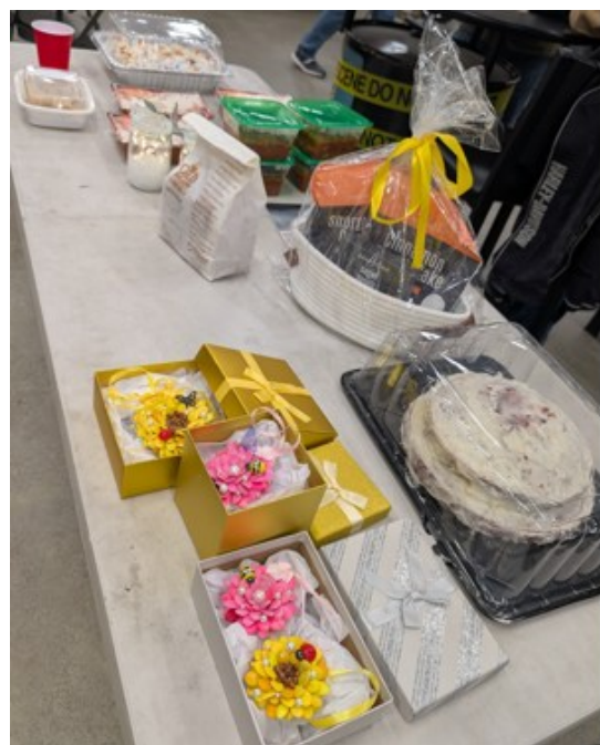
Food and crafts for our fundraising auction