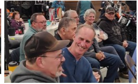
Socializing after the voting.