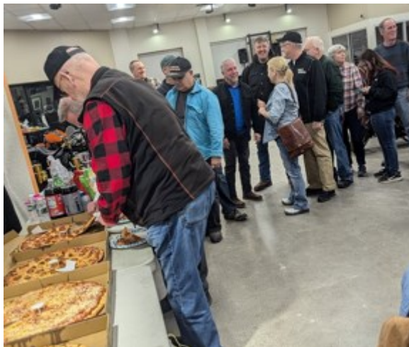
Pizza time!! (Pizza from 'Simply Subs')