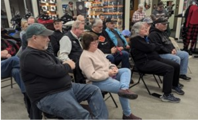
Listening to our presenters