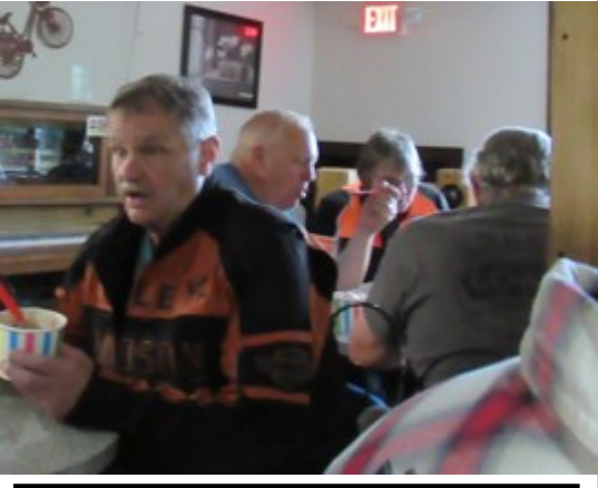
We made our own sundaes at Kellerhaus in Laconia, NH