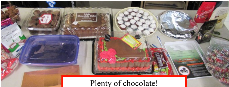
Plenty of chocolate!