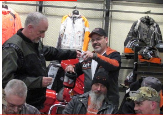
Door prizes and 50/50 drawing