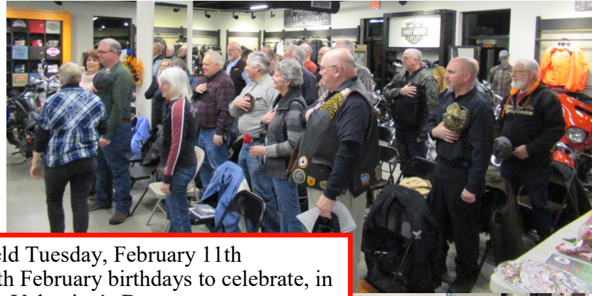
February Social held Tuesday, February 11th We had several members with February birthdays to celebrate, in addition to Valentine's Day.