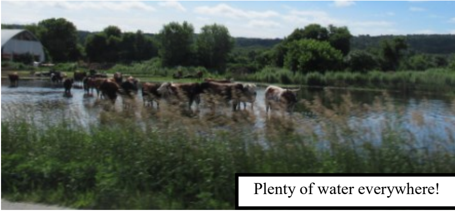
Plenty of water everywhere!