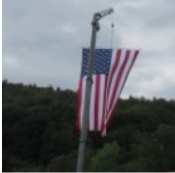
Happy Independence Day!