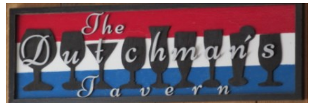
Located in Bennington, VT