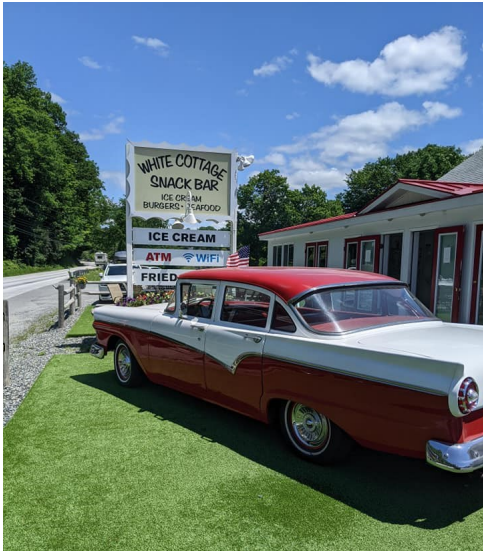
July 10 Ride to White Cottage Snack Bar in Woodstock, VT Ride leader, Trina DeLary