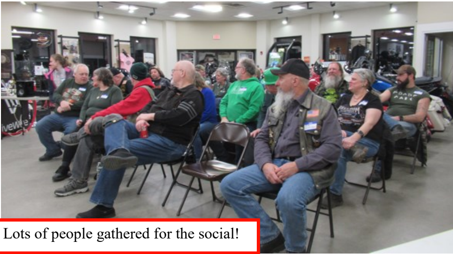
Lots of people gathered for the social!