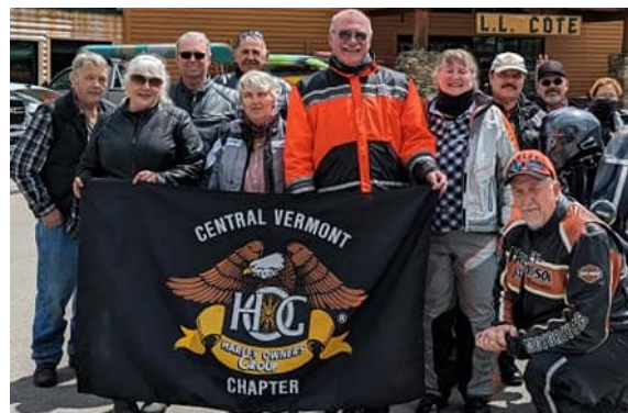
Group photos from some 2023 rides