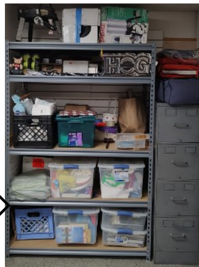
Chapter library on the shelves upstairs