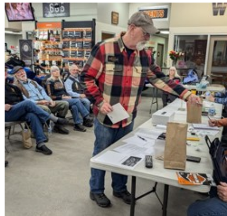
Picking the winner...