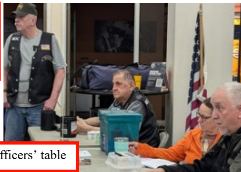
The officers' table