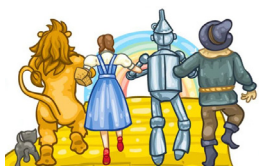
The Wizard of Oz Bilingual Theater at Reno Little Theater