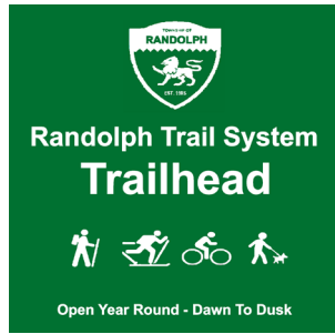
Trails and Open Space