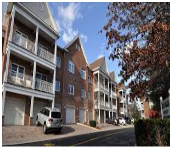
Affordable Housing / COAH