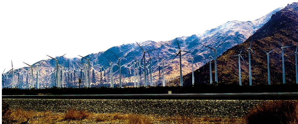
Fig. 1. San Geronio Pass Windfarm in Riverside County, California. With more than 2,000 wind turbines installed, this windfarm produces enough electricity to power Palm Springs and the entire Coachella Valley. 28

It is popular belief that the audio frequency range of human hearing is from 20 to 20,000 Hz and that anything beyond these limits is undetectable by humans. Infrasound is the term that describes the “inaudible” frequencies below 20 Hz. Such a belief is based on the steep slope of hearing thresholds toward the lower end of the human hearing range. 4,5 At 1 kHz, the sound pressure level (SPL) necessary to perceive a 10 phon sound is 10 dB SPL. At 20 Hz, the minimum SPL for 10 phon sound perception has increased to about 84 dB SPL. The phon is a unit that describes perceived loudness level. With decreasing frequencies, the SPLs necessary for sound perception increase rapidly, making very low frequencies at a normally audible intensity more difficult to detect than higher frequencies of the same intensity. Humans’ lack of sensitivity to low frequencies is also reflected in the compression of hearing thresholds. At 1 kHz, the SPLs capable of triggering hearing range from 4 to more than 100 dB SPL, exceeding 100 dB in span and increasing at 10 dB/phon. In contrast, the SPL range at 20 Hz is from approximately 80 to 130 dB SPL, spanning only about 50 dB and increasing at 5 dB/phon. 4 In other words, a relatively small increase in SPL at 20 Hz would