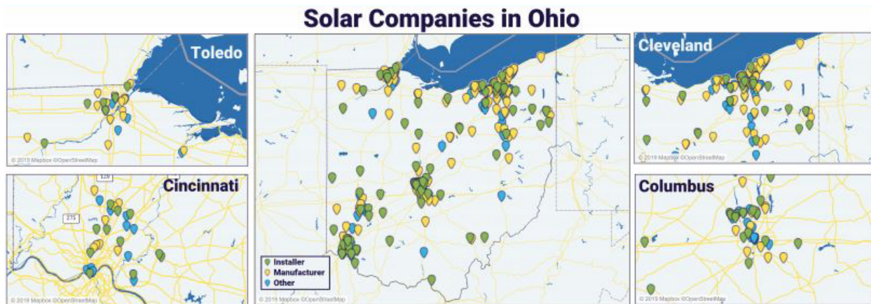
Figure 1-1 Solar Companies in Ohio

The solar industry in Ohio is growing and that could be leveraged during construction and operation of the Project to enhance benefits of the Project and for the state of Ohio. In 2019, Ohio ranked 7 th in the country for the number of solar industry jobs in a state, providing 7,282 jobs (SEIA 2020). There are approximately 288 solar companies operating in Ohio, including installers, manufacturers, and other industry-related firms ( Figure 1-1 ). The companies are concentrated around major cities in Ohio, including Columbus, Toledo, and Cincinnati. The Project Area is located between these three cities.