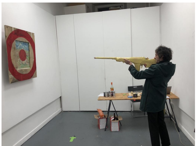
Target Practice , 1200 x 1200 x 200, 2022, Reclaimed Wood, Plastic, Oil Paint, PVC Tape, Cigarettes, Plaster- This Piece is about remotely viewing the conflict in Ukraine, from the English Countryside. During the exhibition preview, members of the audience were invited to shoot this piece with an air rifle. I see the audience participation as an important motif for our universal involuntary involvement in this Conflict.