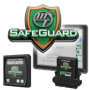
In-cab Console or ISOmod™ - VT ready

SafeGuard™ electronically detects blockages and alerts you with an Audible Alarm and a Visual Display of the blocked row's number. Reduce over and underapplication, save money, and apply liquid products with confidence without having to watch flow monitors or outlets.