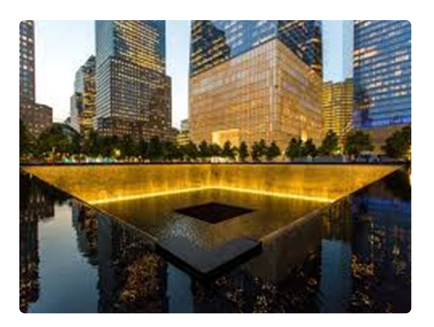
Enjoy Free Time for Lunch on Your Own At Hudson Eats in Brookfield Place (not included)

As a monument to human dignity, courage, and sacrifice, the 9/11 Memorial & Museum honors the nearly 3,000 people killed in the terrorist attacks of September 11, 2001 and February 26, 1993, recognizes the courage of those who survived, and salutes those who risked their lives to help others.