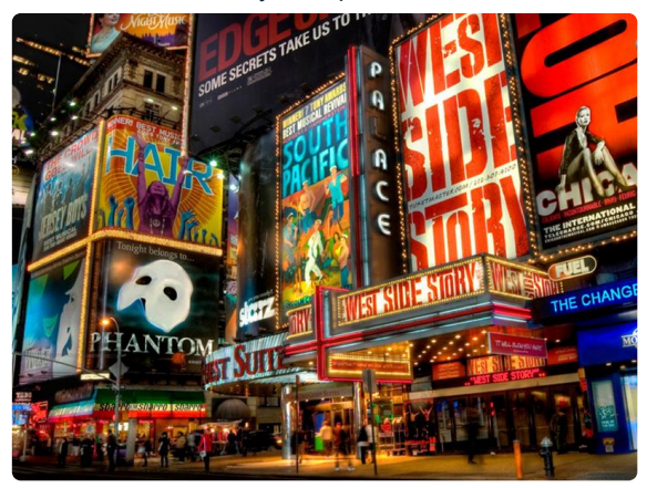
Return to Hotel

We'll coordinate with you to pick a musical that will entertain and enthrall your students!